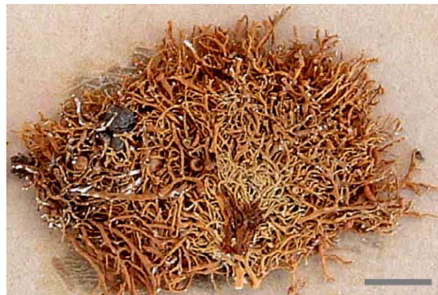
Fig. 2. Ramalina microspora (type specimen in W). Scale bar = 5 mm.