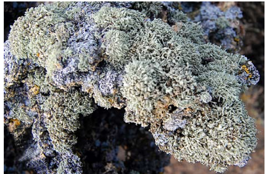
Fig. 6. Ramalina microspora thalli on Cheeseman Island.