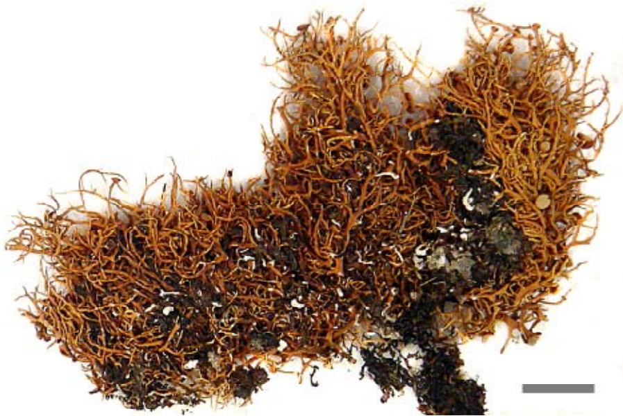
Fig. 3. Ramalina microspora , Hawaiian material (MSC 664729). Scale bar = 5 mm.