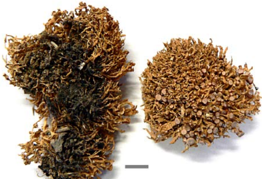
Fig. 4. Ramalina microspora , Macauley Island (CHR 162670). Scale bar = 5 mm.