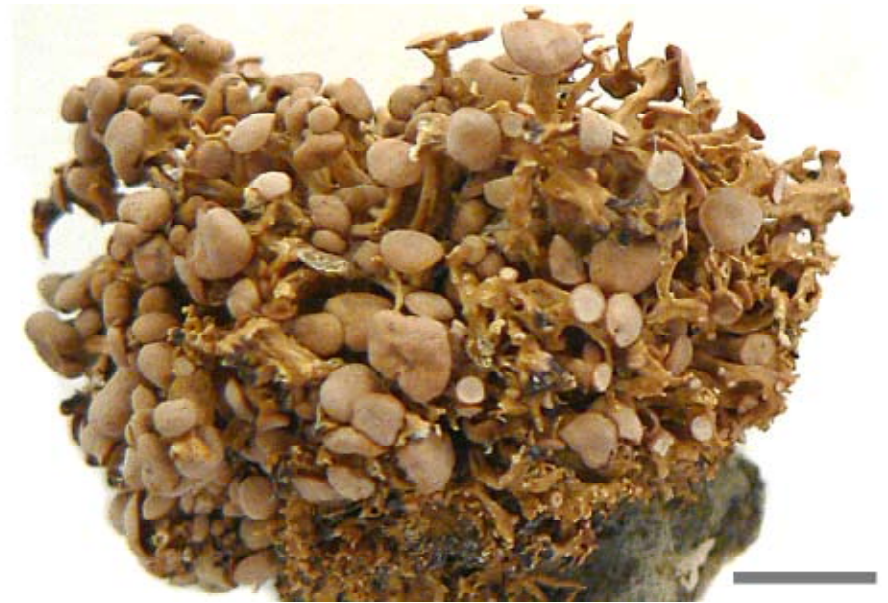
Fig. 5. Ramalina microspora , Curtis Island (AK 257906). Scale bar = 5 mm.