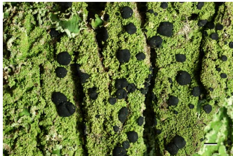
Fig. 2 Megalaria orokonuiana . Holotype. Bar = 1 mm.